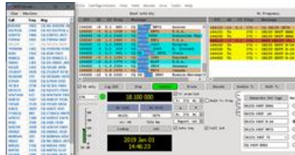
The NIMM Logger+/WSJT-X interface. Participants in the ARRL RTTY Roundup should be using WSJT-X version 2.0 or higher.

released on January 1, includes changes to better support working in conjunction with WSJT-X in contests, including color coding of multipliers and duplicate call signs.