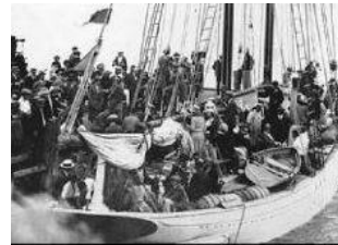
The Bowdoin is launched from Wiscasset, Maine, for the 1923 MacMillan Arctic Expedition.